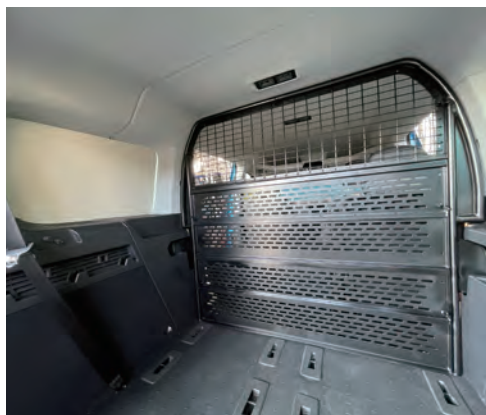
載貨空間高達 1,720 公升