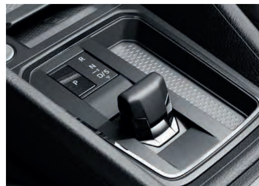
濕式 7 速 DSG 波箱 (DQ381) 及全新 "shift-by-wire" 技術