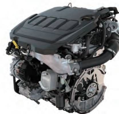
全新 2.0L TDI EVO (EA288) 引擎 迸發出 122 匹馬力，峰值扭矩達 320 牛頓米