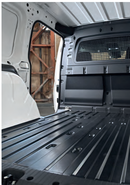
更可選擇 2 座位 Caddy Cargo 獨享 3,700 公升載貨空間