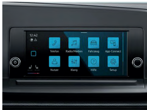
8.25 吋輕觸式中控台 (Infotainment Composition Colour)，支援 App Connect (包括 Apple CarPlay™)